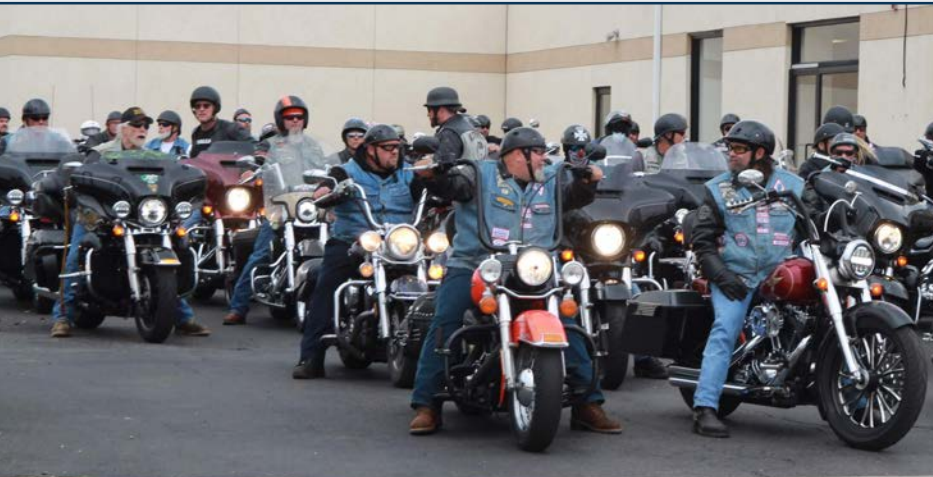
Riders gear up for their journey to Maryville's Williamstown Campus

Through Maryville's 7th Annual Ride for Recovery, you, along with 300 participants, volunteers, and event sponsors, helped raise more than $9,000 for the Peter P. Black IV Scholarship Fund at Maryville, which assists individuals unable to afford substance abuse treatment. A beautiful spring day brought many people together with one shared mission – to help save lives. With inspirational recovery speakers, delicious homemade BBQ food, and an impressive Battle of the Bikes contest, the event was a beautiful example of people coming together to help people.