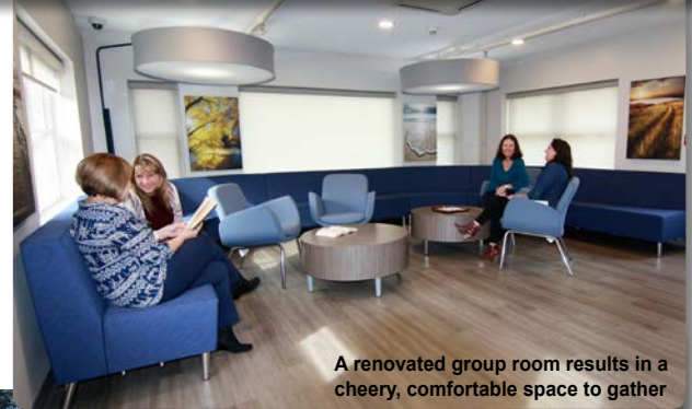
A renovated group room results in a cheery, comfortable space to gather