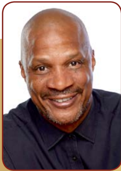
GUEST SPEAKER DARRYL STRAWBERRY