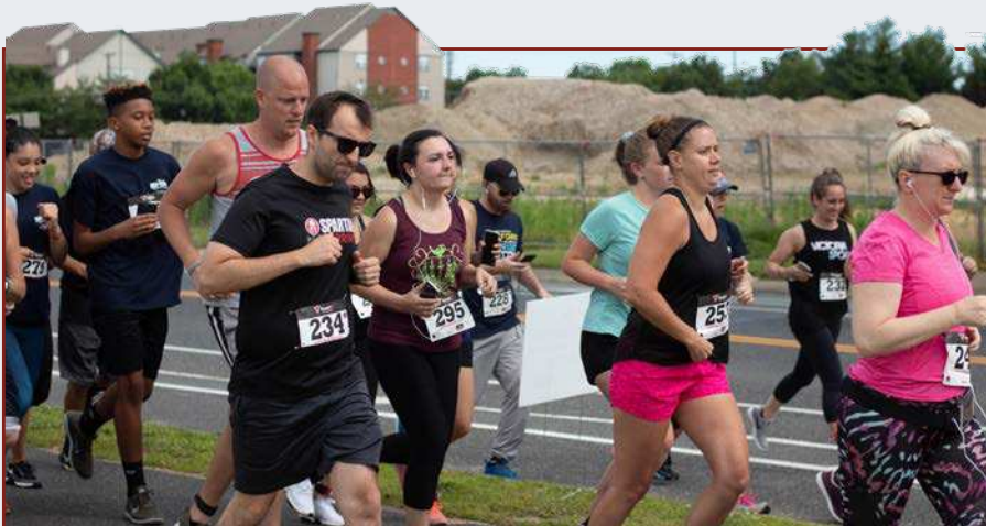
Runners race to support the treatment scholarship fund