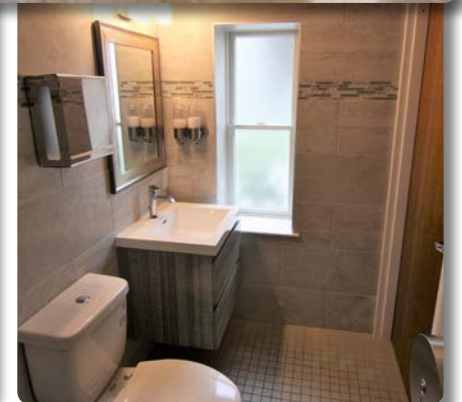
Restrooms receive a fresh new look