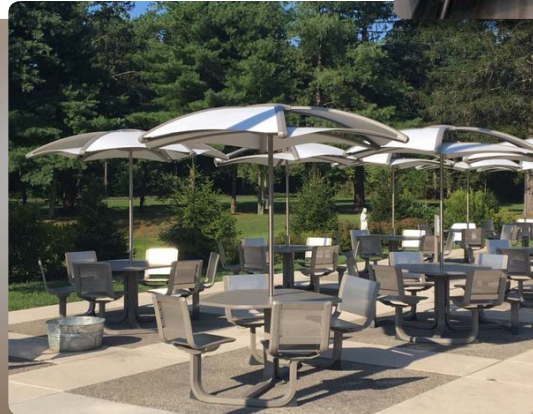
New patio areas create an area for outdoor enjoyment