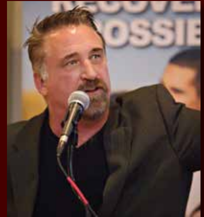
Actor, producer, director and guest speaker, Daniel Baldwin.

"We need to work harder to raise awareness and help those who struggle with this disastrous drug epidemic," said Baldwin. "Maryville should be proud of what they're doing because their effort is making a difference and it's exactly what everyone should be doing nationwide."